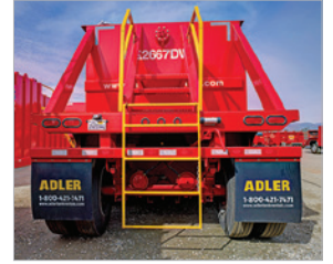
Tank configurations may vary in selected markets